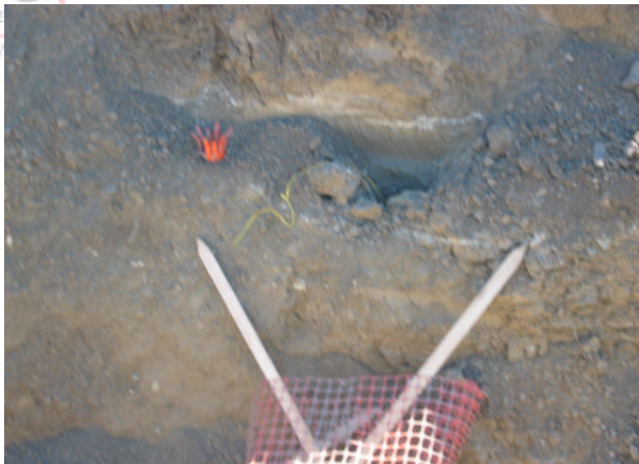
Enlarged image of exposed area