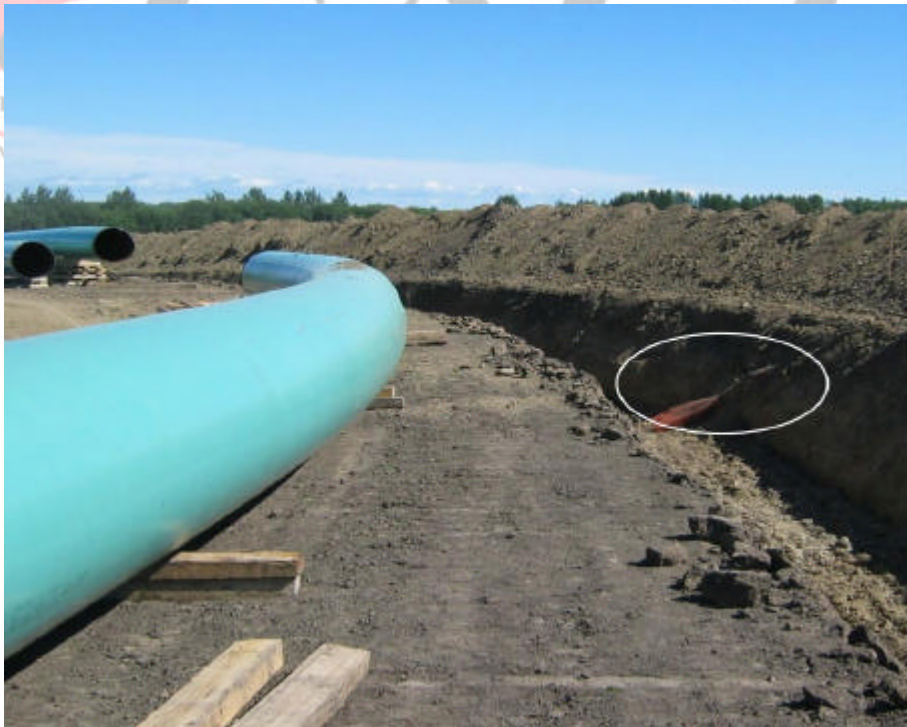
Excavation may unearth wires

If you find suspected loaded seismic shot holes, do not touch them. Contact your Supervisor or Party Manager immediately or contact SRD or the RCMP.