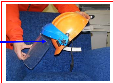
Photo of face shield and cracked area

Examples of "whipchek safety wires" for hose-to-hose and/or hose-to-tool connections